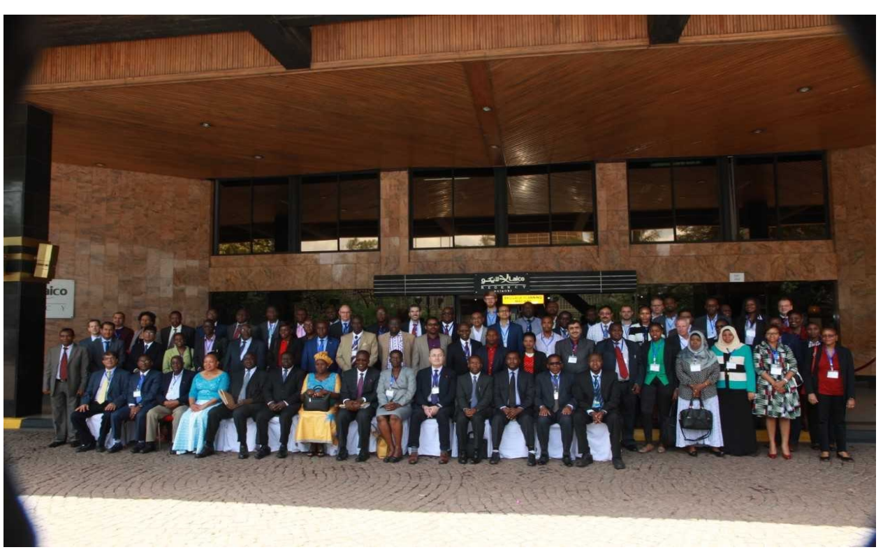
East African Community Pharma Stakeholder's Consultation Workshop, Nairobi- Kenya, November 2017