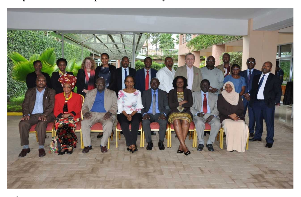
13th EAC MRH Programme Steering Committee meeting, Dar es Salaam, July 2018